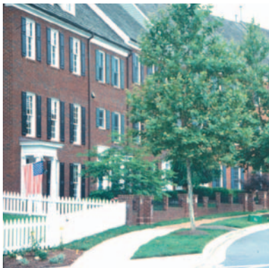
Kentlands, Gaithersburg, MD