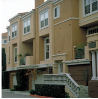
Orange County, CA