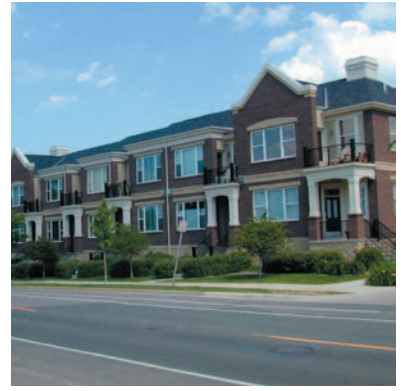
North Loop, Minneapolis, MN