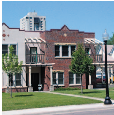
Portland Place, Minneapolis, MN