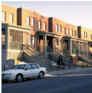
Augsburg Townhomes, Minneapolis, MN