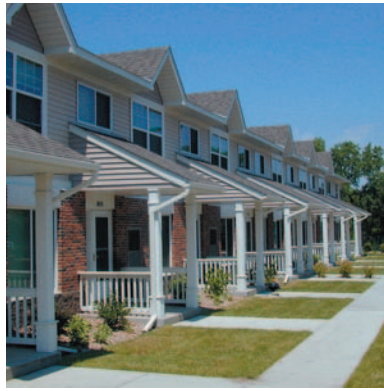
Golden Valley, MN