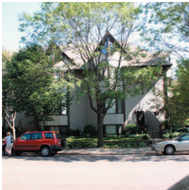
Cathedral Hill, St. Paul, MN