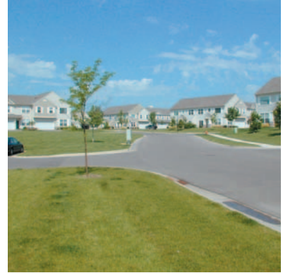
Maple Grove, MN