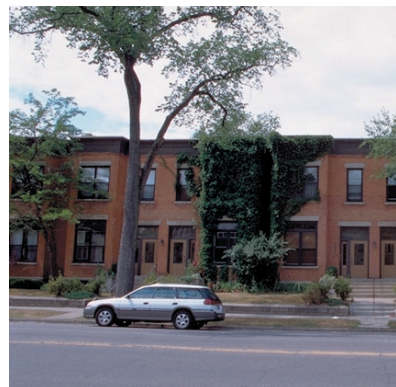
Lyndale Avenue, Minneapolis, MN