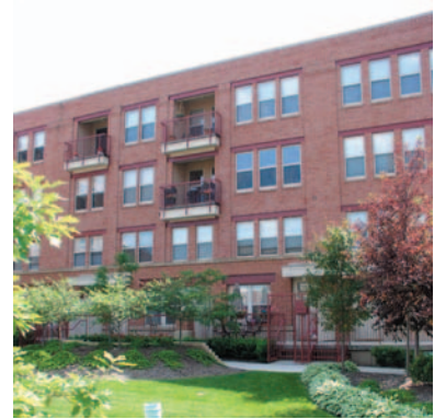
Warehouse District, Minneapolis, MN