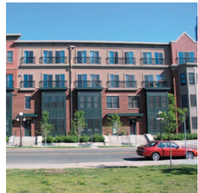
North Quadrant, St. Paul, MN