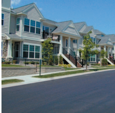
Golden Valley, MN