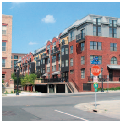
Warehouse District, Minneapolis, MN