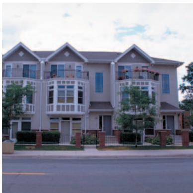
Hennepin Avenue, Minneapolis, MN