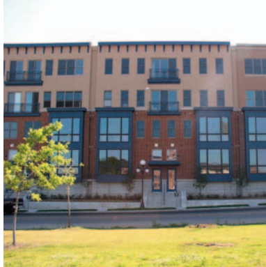
North Quadrant, St. Paul, MN