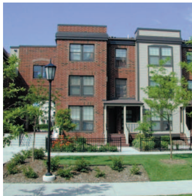
Elliot Park, Minneapolis, MN